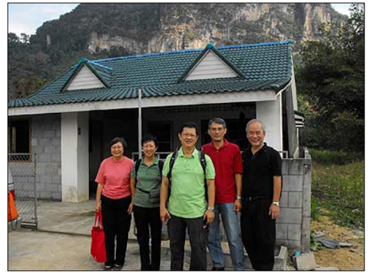
The Mission Team from Petaling Jaya Gospel Hall, K.L. Malaysia. Their visit to Eaglesrest was a great encouragement to us all.